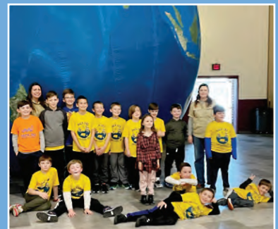
Cub scouts explore the Earth using our 22' Earth Balloon.