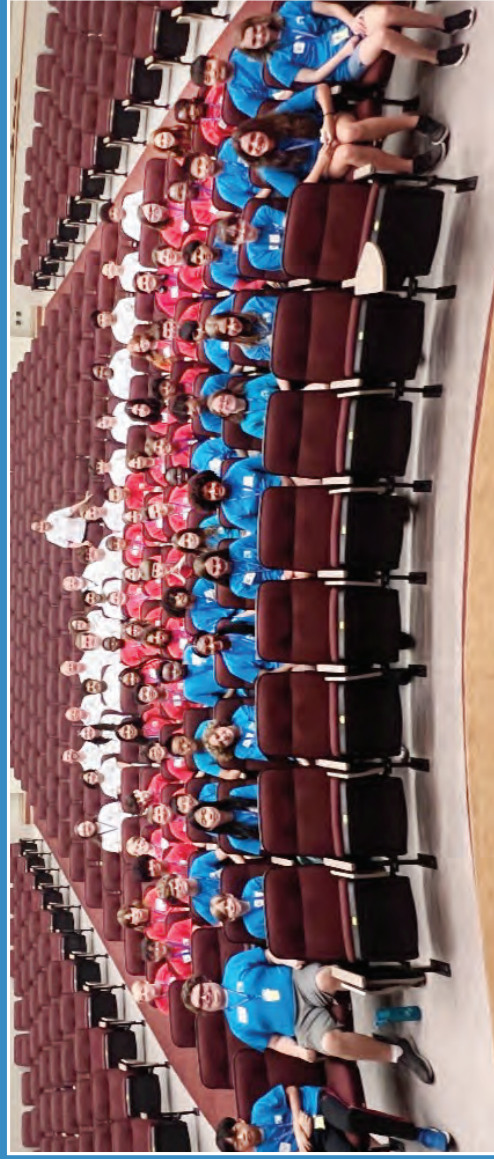
Group Photo of Destination Moon and Mars cadets & staff.