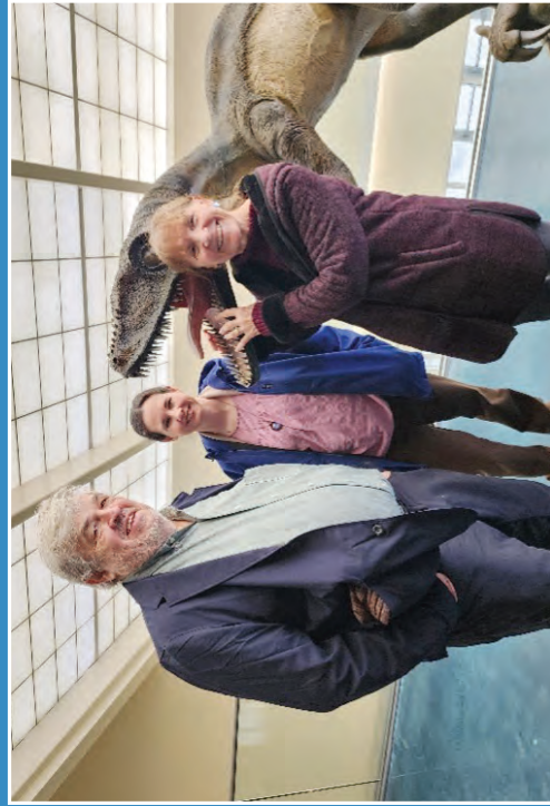
Venus the Velociraptor greets Space Grant visitors.

DASEF strives to improve the quality of life through its advocacy of education, the environment, and strengthening the workforce.