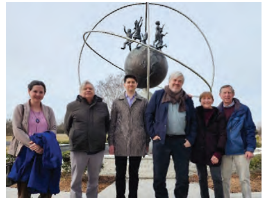
Delaware Space Grant & DASEF Leadership