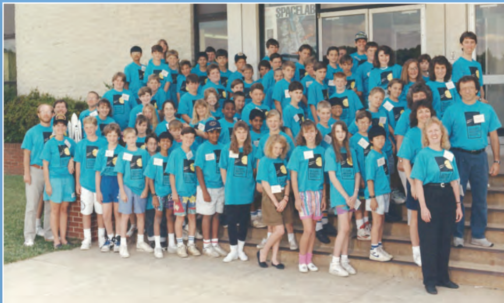
DASEF's 1st Delaware Aerospace Academy: Glasgow High School in 1990.

THIRTY-FIVE YEARS LATER, DASEF CONTINUES TO INSPIRE AND EDUCATE YOUTH AND THEIR FAMILIES.