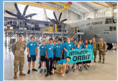
Destination Orbit cadets spend the day at the Air National Guard.