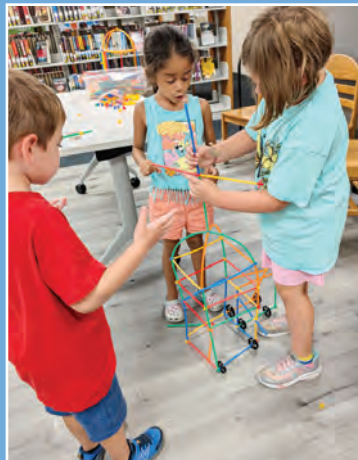
Group construction during a library visit.

We have served over 682,622 students, teachers, and families in the Delaware Region. With the pandemic behind us, DASEF is moving forward!