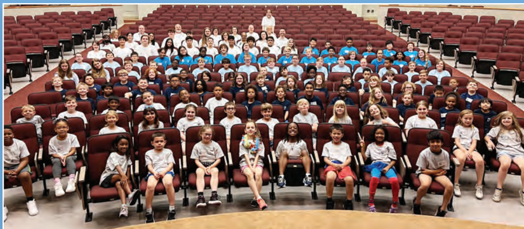
DASEF's 35th Delaware Aerospace Day Academies: University of Delaware in 2024. (Overnight not shown)