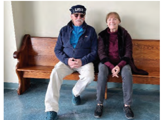
DASEF's Chairperson and President & CEO