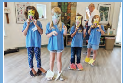
Dinosaurs at Destination Discovery.